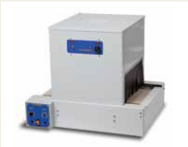
Clamco 820 shrink tunnel

Our family of Clamco tabletop sealers and shrink tunnels are the perfect solution for dependable, long-life performance. Designed for smaller production demands, these products are constructed of heavy-gauge materials and combine advanced engineering with rugged, time-proven features. Each is expertly crafted by Clamco, the industry's respected name for reliability and value.