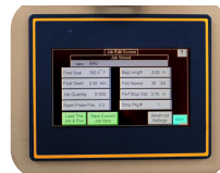
An easy to use interface is provided on a color touchscreen.