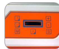
Easy to program and operate controls for a quick start to a shrink wrap finish