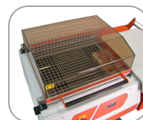
Magnetic hold-down features secures the hood during film sealing and shrink wrapping