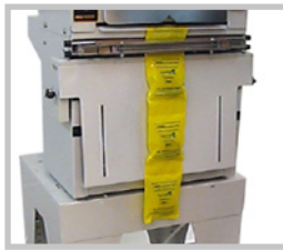
Capable of strip packaging