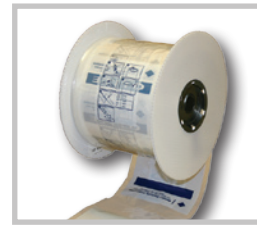
Rollbags™ pre-opened bags-on-a-roll